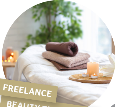
FREELANCE BEAUTY THERAPIST