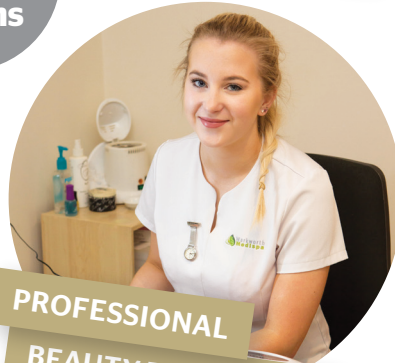
PROFESSIONAL BEAUTY THERAPIST