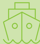
Cruise Ship Therapist