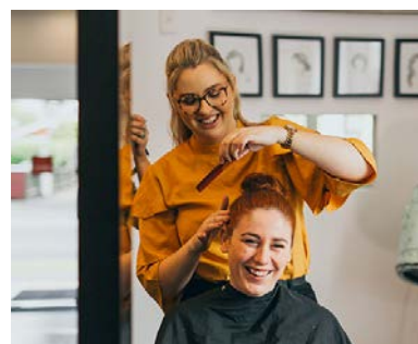
Hairdressing apprenticeship programmes were streamlined

After considerable consultation on the hairdressing suite of qualifications, the apprenticeship programme for the New Zealand Certificate in Hairdressing (Professional Stylist, Level 4) was rewritten and a new industry training programme introduced for the New Zealand Certificate in Hairdressing (Salon Support, Level 3).