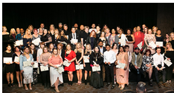
2017 HITO graduation ceremony.

HITO hold an annual graduation ceremony to celebrate the achievements of newly qualified graduates, including professionals who recently completed the Qualified by Experience process. Over 60 graduates from across the country attended the 2017 ceremony in Auckland with family and friends. The ceremony included an inspiring guest speaker and was followed by the New Zealand Hair and Beauty Industry Awards.