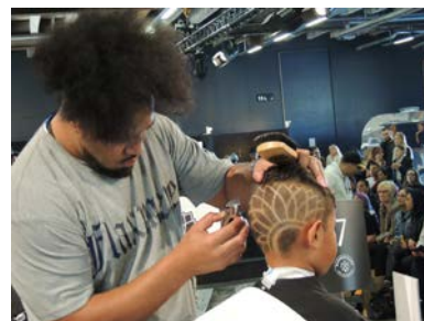
BarberCraft competitions, 2017.

Established by HITO in 2016 to recognise the professional skills of barbers and promote barbering as an exciting career option, BarberCraft has become the biggest barbering event in Australasia. Barbers from across the country come to compete in competition battles, find inspiration, share ideas and network in a fun setting. It has become an excellent platform for HITO to emphasise the value of qualifications to potential and experienced barbers. The event also attracts many men and women outside the industry, reflecting the growing interest in men's grooming.