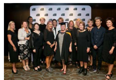
HITO staff at Graduation, 2017.