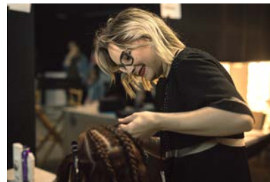
HITO apprentice working backstage at NZFW 2017.

To further leverage our presence at the event, HITO held a mini BarberCraft activation during the public-facing New Zealand Fashion Weekend, offering free cuts from Maloney's Barbers.